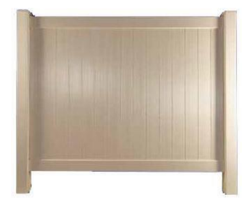
Special Notes on Fencing:

3. Vinyl privacy, white or sand in color, 6 (six) feet in height, with or without decorative caps.