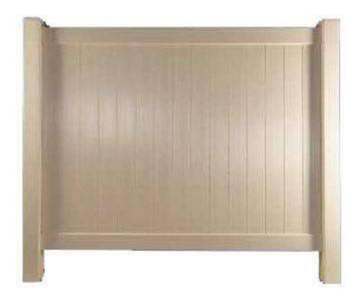
Special Notes on Fencing:

3. Vinyl privacy, white or sand in color, 6 (six) feet in height, with or without decorative caps.